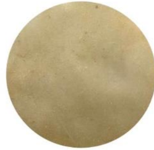
falo Natural Drum Heads BKH:DC:602