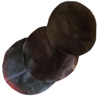
Buffalo Furred Drum Heads BKH:DC:601