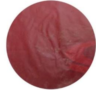
Calf Thin Transparent Drum Heads BKH:DC:604