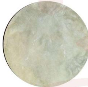
Calf White Chalk Drum Heads BKH:DC:606