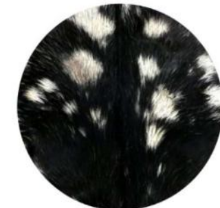
Goat Furred Drum Head BKH:DC:612