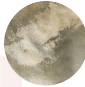
Calf Natural Drum Heads BKH:DC:603