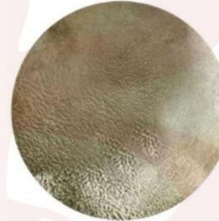
Camel Furred Drum Heads BKH:DC:607