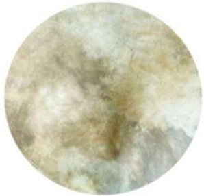
Calf Natural White Drum Heads BKH:DC:605