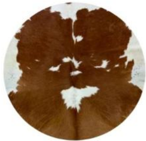
Cow Furred Drum Heads BKH:DC:609