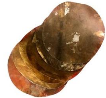
Camel Natural Drum Head BKH:DC:608