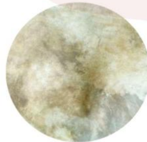
Cow Natural Drum Heads BKH:DC:610